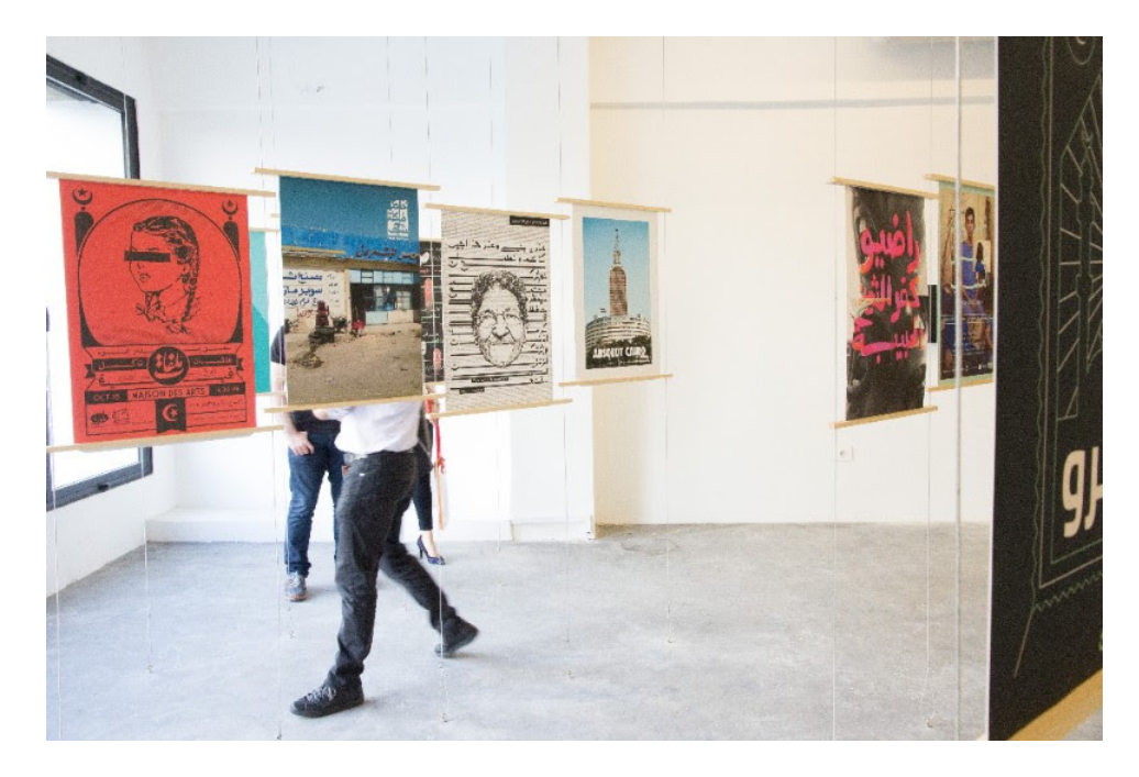
Cairo Poster Exhibition, Beirut Design Week.

'Beirut has always been referred to as the city of creative export with many individuals succeeding abroad and partake in shaping other cities with their art and design skills. During the past couple of years, and for the first time in our recent history, the city is experiencing a rise in local independent initiatives and movements wanting to reshape our city to become a more just, tolerant and livable space.'