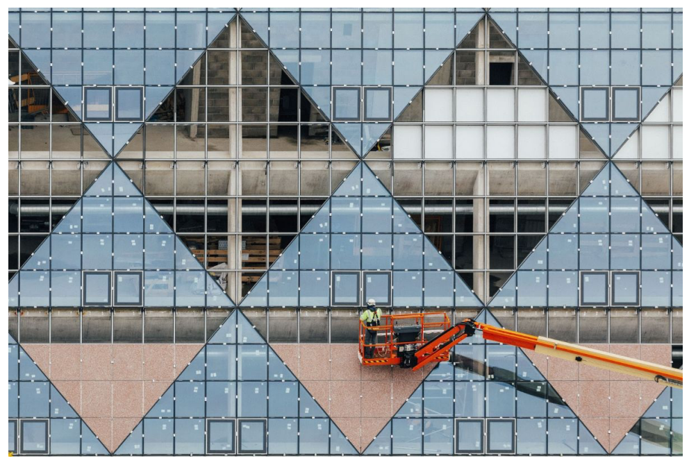
Design District comprises 16 buildings by 8 leading practices. Here glazing is being installed on the magnificent, chamfered facade of one building by 6a architects.

Despite a year of unexpected pandemic-induced delays, construction is almost complete on a handful of buildings as Design District confirms its first tenants will move in this spring – fantastic news for the future of the UK's creative economy.