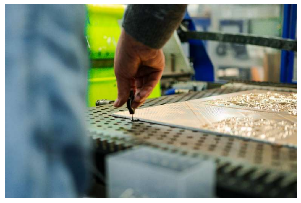
Vinyl production at Pressision.

G . F Smith has a long-standing reputation as a preferred partner of the creative industries, working closely with an ever-widening network of artists, designers and makers around the world. As well as collaborations with established creatives, the company also actively engages with art and design schools and courses around the UK to support emerging talent. The Colorplan vinyl project is the perfect example of this approach in action.