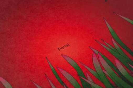
Album art by Adomas Lukas Petrauskas (left) and Lucy Michaela (right).

Father created a distinct sound to reflect each of the 55 colours that make up the Colorplan paper range, resulting in an expansive palette of sounds that could then be used to compose a series of different pieces of music. These include 'A Journey through Colour' – an extended soundscape that acts as a sonic exploration and interpretation of the complete Colorplan collection – and 'A Journey Through Creativity' – a sequence of four pieces, each comprising a specific colour grouping