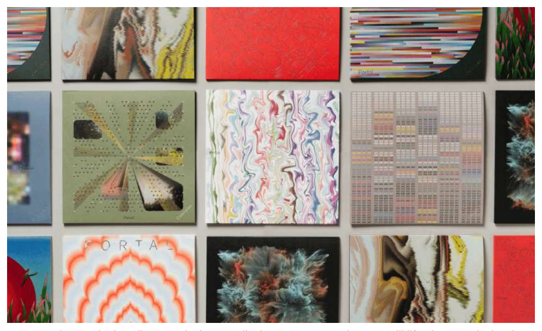
MSOA students' winning album art designs on display at SOUP Manchester. Still life photography by Tian Khee Siong.