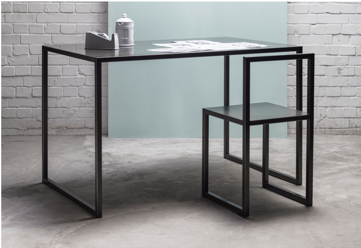
The minimal and clean lines of Form-Desk & Poseur add a sense of openness to a room.

Jennifer's rigorous design thinking includes the thoughtful addition of cable-management solutions, power outlets and data ports incorporated into the furniture. The adaptable designs are available with a broad choice of materials, colours and finishes.