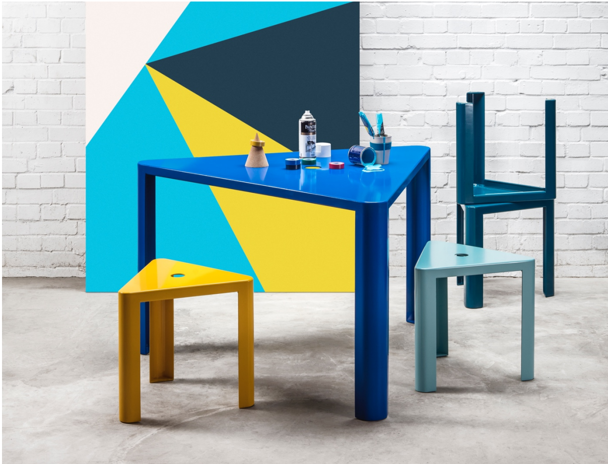
One of Jennifer Newman's latest additions, the Triangle range can be purchased as standalone pieces, or grouped to create tessellated patterns and shapes.

design, the studio is still working to do more, and is now exploring ways of eliminating prototypes from the development process to further reduce material usage.