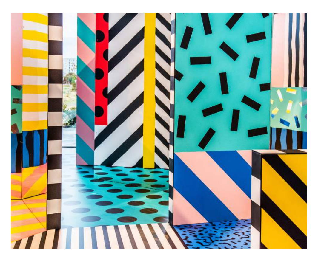
WALALA X PLAY by Camille Walala.

The waterways of the Greenwich Peninsula, the curve of the Thames, and the internal shapes and angles of the buildings themselves are referenced and represented in the internal flow and reflections contained within WALALA X PLAY. The layout of the installation playfully mirrors the shape of the building and its components are positioned in response to the mapping of the building and the peninsula around it. Seen from above, there is a clear, fluid relationship between the walls of the installation and the aerial view of the wider area, making the piece a structural extension of its immediate environment.