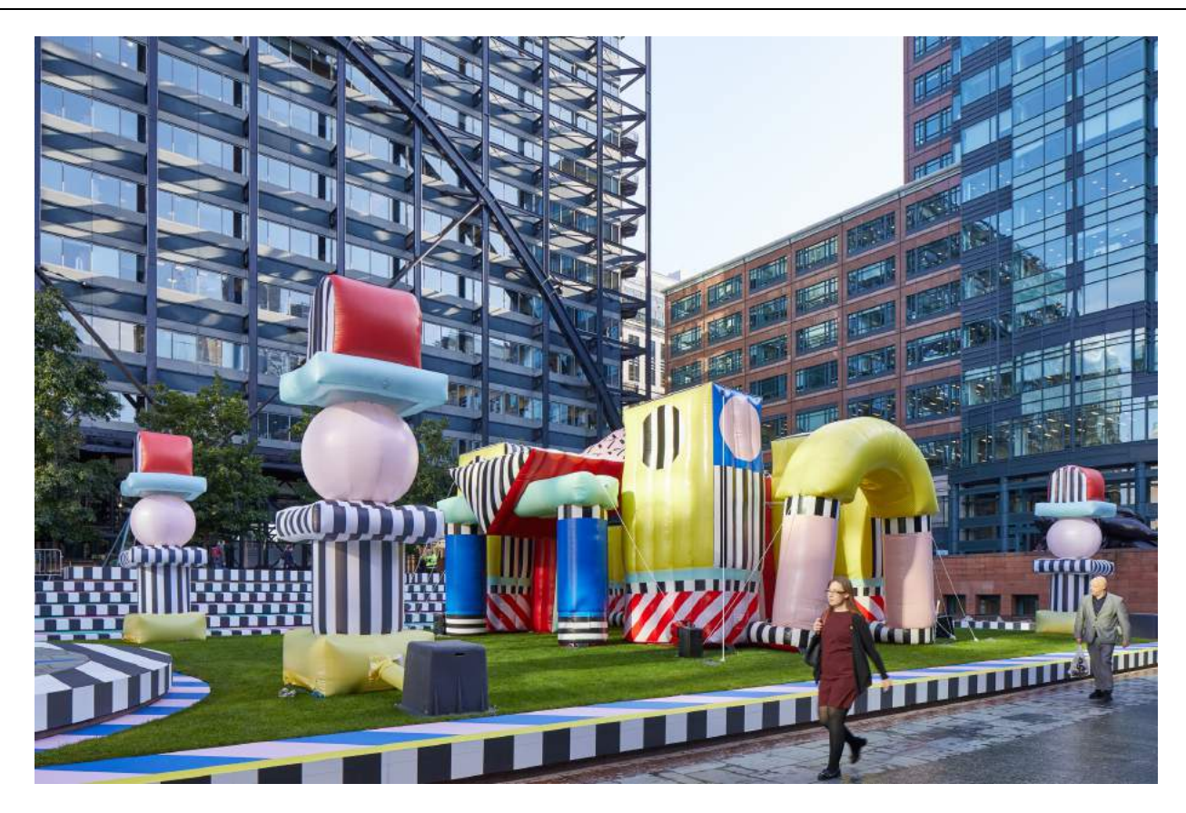
Villa Walala by Camille Walala.

Set to appear on 16 September , the beginning of London Design Festival , Villa Walala is a boisterously colourful and invitingly soft-touch structure made from 'blocks' of vinyl, sealed PVC inners and highstrength nylon, adorned with Walala 's characteristic digitally printed patterns. The blocks will be inflated by fans, turning them from flat shapes into three-dimensional forms. They are the component parts of a huge architectural landscape that stops passers-by in their tracks and invites them to step away from the everyday, even if just for a moment. The villa's vibrant tones, tactile surfaces and engaging shapes are designed to complement and enhance the recreational function of Broadgate, while providing a striking contrast to the typical colours and textures of its surroundings.