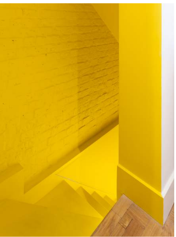
Beresford Road by Russian for Fish.

These colour combinations serve to lift and brighten the space, helped by the addition of a large skylight in the existing side-return extension – turning what had been a lifeless passageway into a hall of light, dotted with plants to introduce warm and vibrant green tones into the palette.