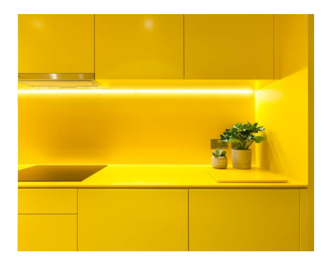
Beresford Road by Russian for Fish.