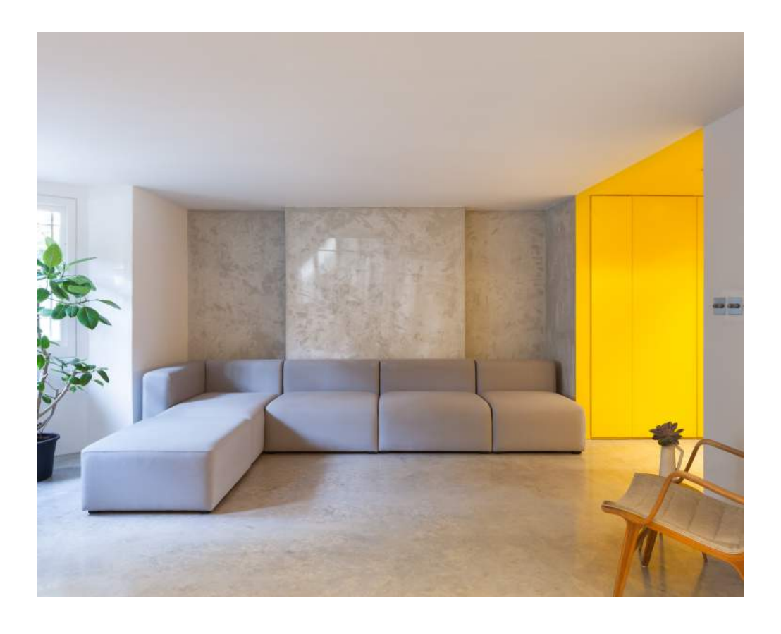
Beresford Road by Russian for Fish.

that preserves its existing contrast with the top half of the flat, but now the journey between the two is an eye-catching surprise, rather than a disappointment.