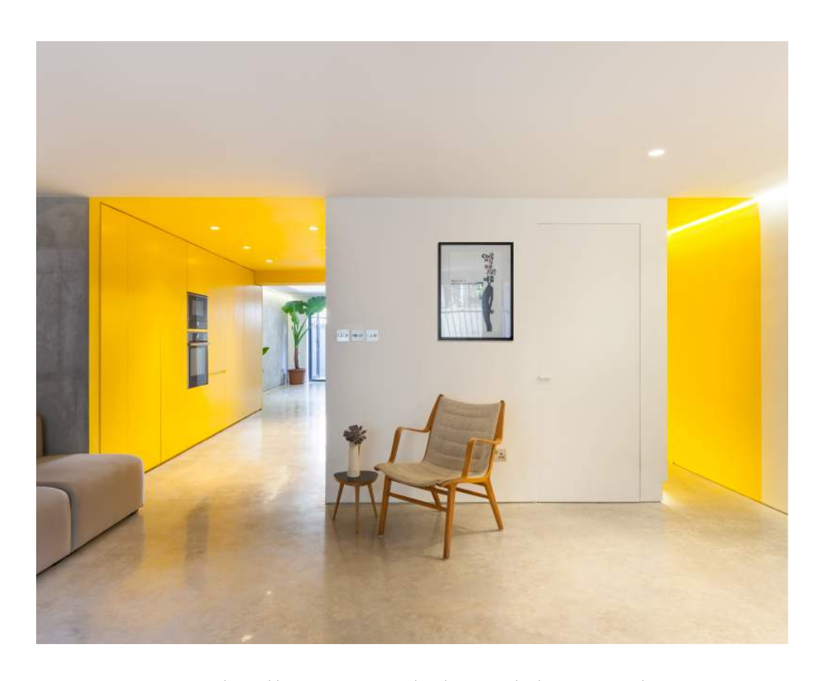
Beresford Road by Russian for Fish.