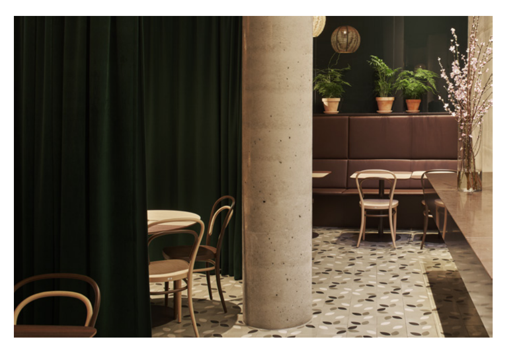
Velvet curtains can be pulled to create round chambre separées. A cantilevered stone shelf counter-balances the verticality of the concrete column.