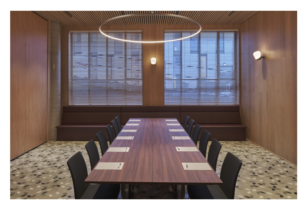
Hardwood ceiling and walls adds dignity to a conference room. Sconce lights by Arne Jacobsen.