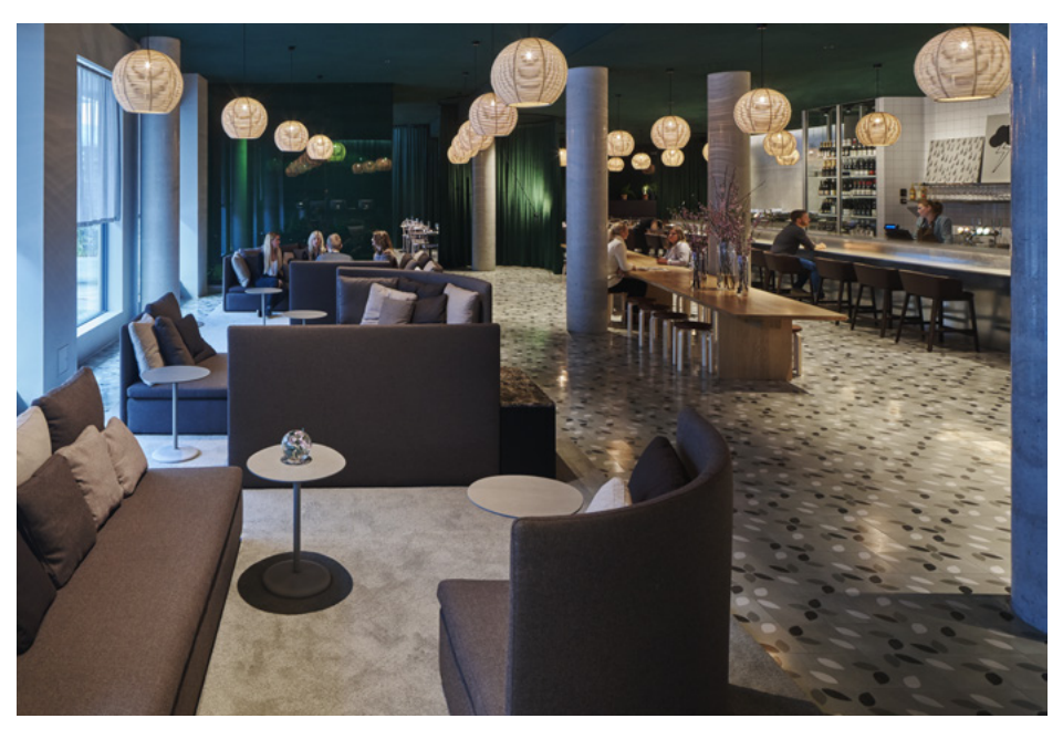
Space, structure and objects are equal to the architectural composition. Vertical concrete columns, horizontal long wooden table, grid of pendants and handmade cement tile floor pattern designed by Claesson Koivisto Rune.