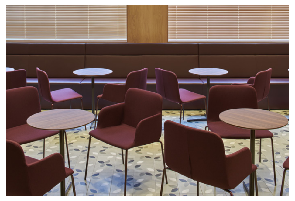
The Brianza chairs echo the scattered leaf pattern of the conference room floor. Both designed by Claesson Koivisto Rune.