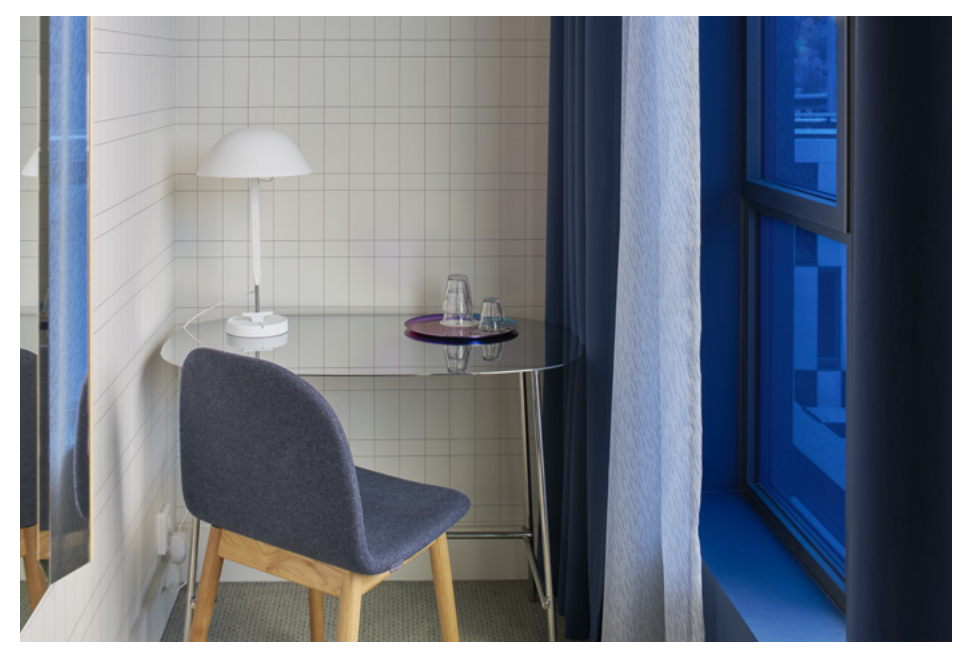
Compact yet generous. The custom desk in polished stainless steel and the Sideview wall mirror reflects the light.