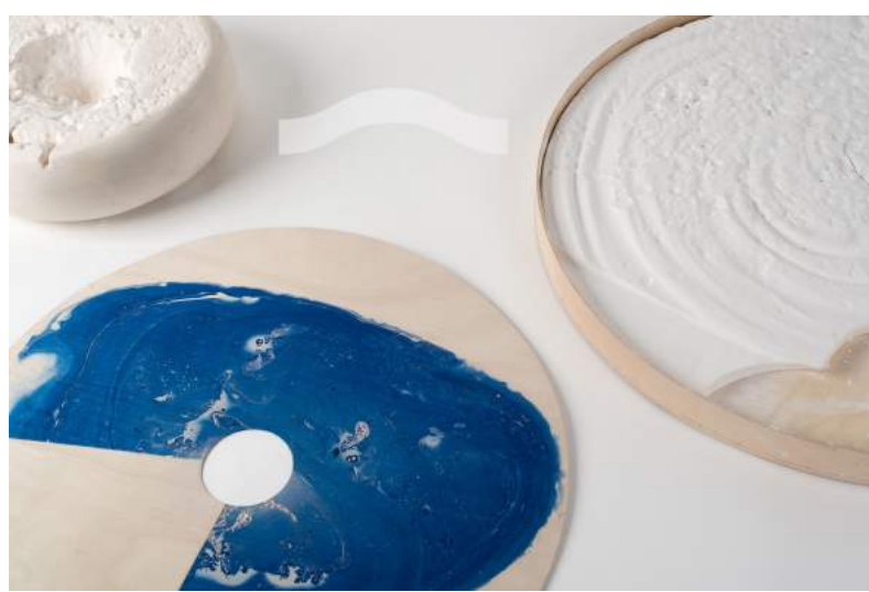
Landscapes of Water by Kirsi Enkovaara