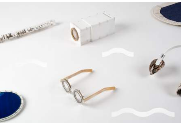
(Left) Fenster Farm by Simon Denzel (Right) The Domestic Sea Collection by Unit Lab