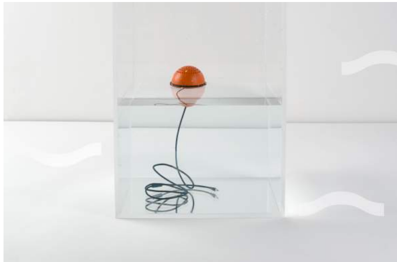
Natural Networks by Six:Thirty and Matteo Loglio