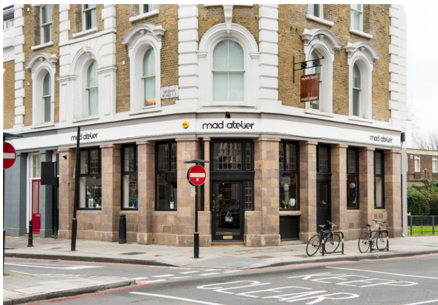
The exterior of Mad Atelier, formerly the Lord Cecil pub.

'We chose our premises largely because we wanted to show how striking Mediterranean design can be in the British context, and nothing is better than a pub to demonstrate that. We have had such a warm welcome here and heard such great stories about the pub, we really wanted to pay tribute to Mad Atelier's home.'