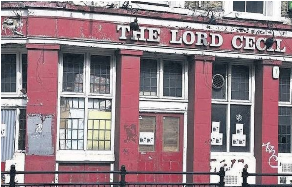
Mad Atelier was formerly the Lord Cecil pub.