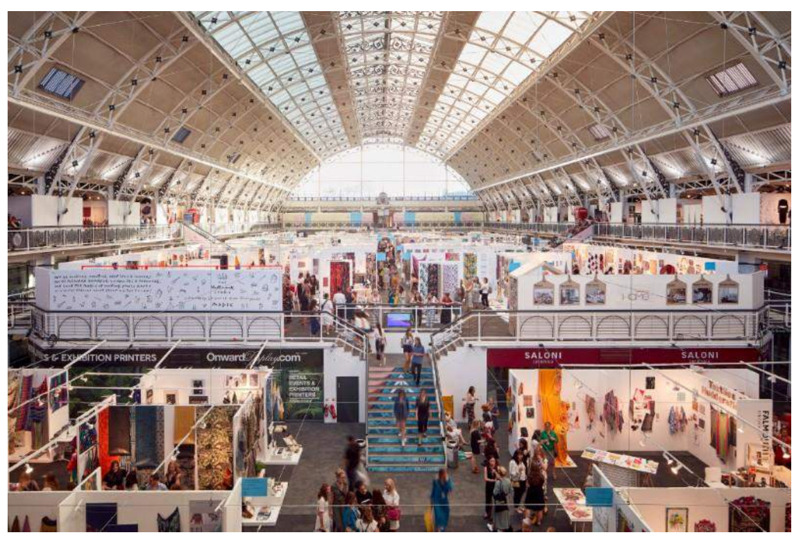
New Designers at the Business Design Centre yesterday

Right now, 1,500 creative minds set to shape the design world of tomorrow are gathered in London to showcase and share their talent. Yesterday, legendary fashion designer Orla Kiely opened Week 1 of New Designers 2018 – the UK's biggest and widest-ranging exhibition of emerging talent in every contemporary design discipline.