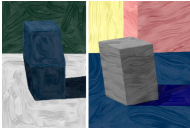
Sketch of chess pieces for M-LXL's chessboard

Launching at Ace Hotel London Shoreditch 18–23 September 2018