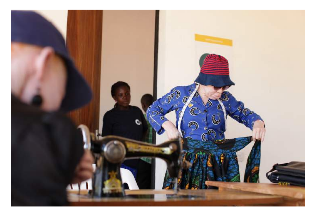
Tailoring workshop in 2017.

The programme was inaugurated in 2017, and saw 85 members of the Ukerewe community take part in workshops. As a direct result, alumni of the programme set up six income-generating community groups – all of which still meet and work at the UTC: