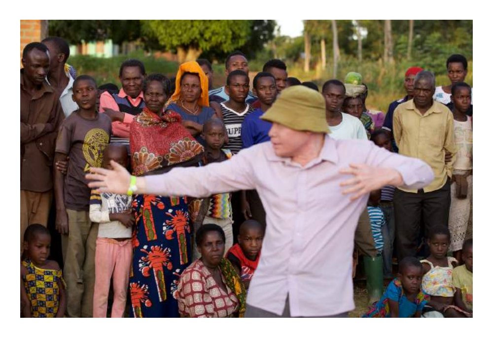
Storytelling and performance workshop in 2017.