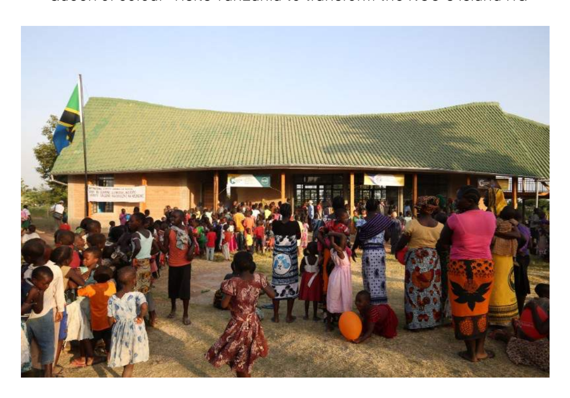
Umoja Training Centre (UTC), photography by Harry Freeland.

'Queen of colour' visits Tanzania to transform the NGO's island HQ