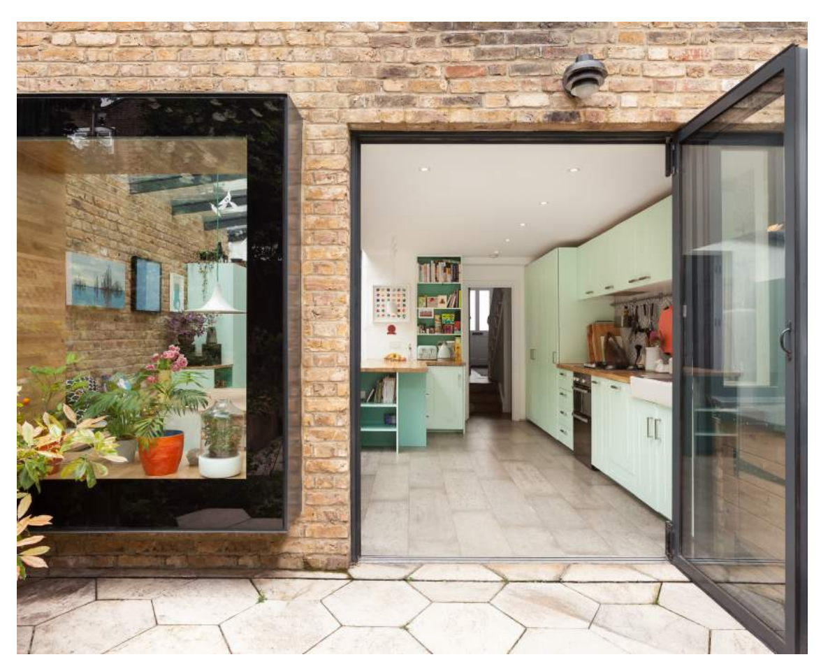
Walford Road by Russian for Fish.

A garden-embracing ground-floor extension for one couple (and their cat)