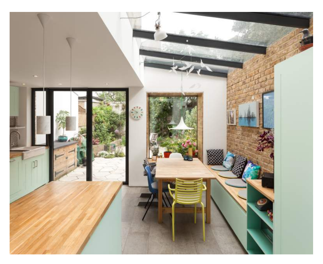
Walford Road by Russian for Fish.

An existing rear lean-to had to be demolished to allow Russian For Fish to build out into the side return and take advantage of the full area of the plot. The installation of steel box frames and beams allowed the ground-floor outrigger walls to be removed without affecting the first floor. A pitched skylight spanning the length of the outrigger was set against an exposed brick wall, creating a naturally floodlit dining area. A bench running along the wall, fitted with low cupboards, created both seating and storage, while a large, projecting picture window lined in oiled prime oak at the head of the dining area maximised the garden view and provided both an extra seat and a much-needed chill-out space for the cat.