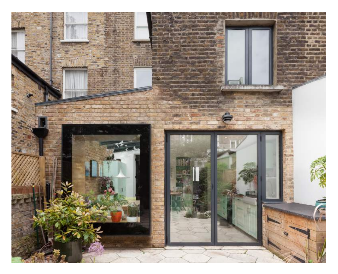
Walford Road by Russian for Fish.

After a year of design and construction work, the project was complete, and the owners – and their new baby – are now enjoying their garden oasis in the urban jungle of Stoke Newington.