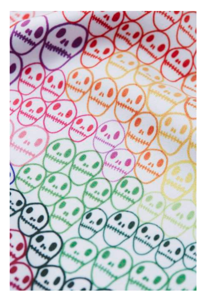
Dead Colourful cleaning cloth by Hayden Kays for Cubitts

Dead Colourful is available free to all existing Cubitts customers or available for £5 from Cubitts ' workshops in Spitalfields, Borough and Soho, as well as online at cubitts.co.uk . All proceeds will be donated to Kay's chosen charity, Cure Blindness: The Himalayan Cataract Project , which campaigns to eliminate curable blindness in individuals with no access to healthcare. Spectacles, Testicles, Wallet and Watch – from a limited edition of 100 pieces – costs £10, which will be donated to Macmillan Cancer Support . Kays' tenure will be followed by another (possibly less rude) artist in due course – watch this space.