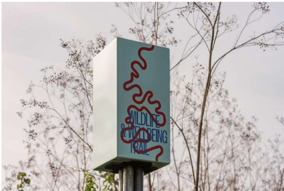
Barking Riverside Wildlife & Wellbeing Trail.

Studio Vandling worked closely with Channel Projects to create a graphic identity for the trail that challenges the visual perception of nature walks, making the design enticing for people with various pre-existing interests in the natural environment to engage with the trail.