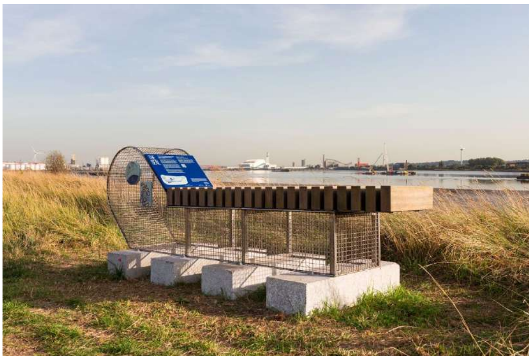
Barking Riverside Wildlife & Wellbeing Trail.

From birds and bats to snakes and seals, a rich but rarely explored world of wildlife exists around the Thames as it flows through East London. Now, a new Wildlife & Wellbeing Trail conceived and delivered by Create London and funded by Barking Riverside Ltd is set to open up the secrets of this hidden ecosystem.