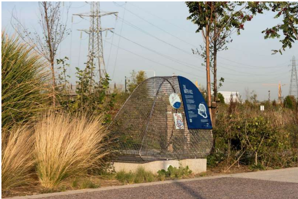
Image credit: Barking Riverside Wildlife and Wellbeing trail. Image by Thierry Bal, courtesy Create London.