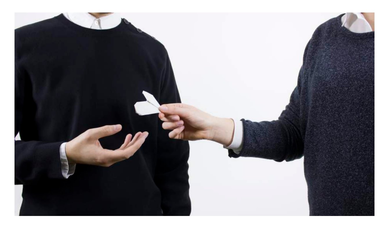
PRESS RELEASE | Special Projects | Missing Pages | 22 November 2016

DÜO is designed to alleviate any relationship tensions that might have emerged during the process of assembling an article such as a bed. Through a brief couples-therapy craft exercise, emotional balance can be restored, and any arguments triggered by dowelling rods or panel pins can be swiftly defused.