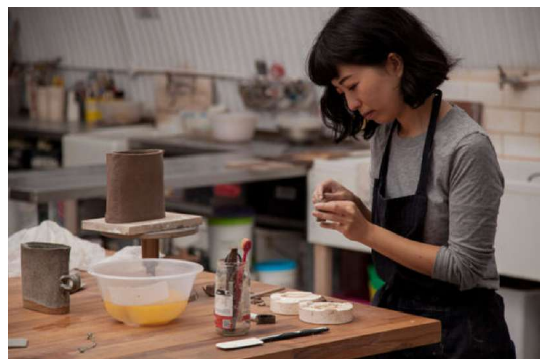
Studio shot