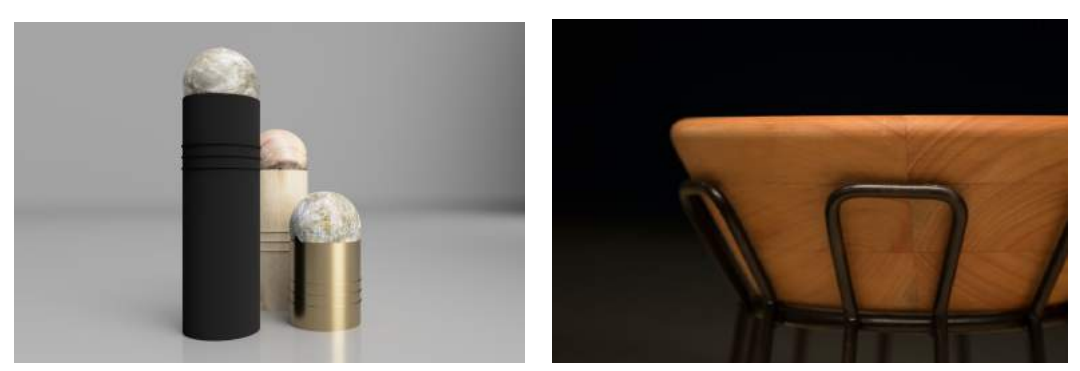
(Left) Render of Cocina by Estudio Tosca. (Right) Horing by Izzi Design.

Founded in 2017, Tosca is the only Uruguayan industrial design studio focused on the development of products using semiprecious stones – found in abundance in Uruguay but rarely used in making products. Both sculptural and functional, Estudio Tosca's collection of napkin holders, spice jars, pestle and mortar, and candlesticks all fuse materials such as wood and metal with stones such as agate, amethyst, jasper and quartz. The naturally varied patterns within the stone ensure that no two Tosca products are ever the same.