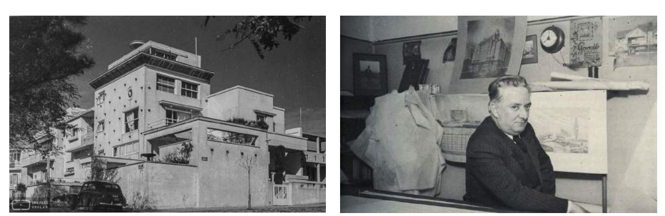
Museo Casa Vilamajó and portrait of Julio Vilamajó.

Matteo Fogale and the designers collaborated over the course of a series of workshops to create the finished products, which include furniture , lighting and other home accessories , and are all handmade in Uruguay by project collaborator Amtica – an architect and third-generation carpenter – using locally sourced materials and production methods.