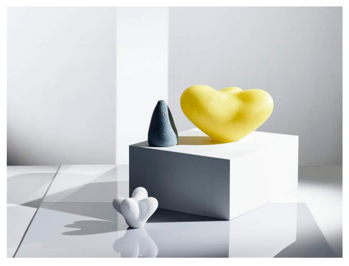
Desire by Louis Thompson represented by London Glassblowing Gallery. Art direction by Hana Al Sayed.

No event is more important to the celebration of cutting-edge, museum-quality craft in the UK than Collect: The International Art Fair for Contemporary Objects . This February, the Crafts Council gathers 40 of the most prestigious galleries together to show more than 400 artists, from 13 countries around the world. Filling the entire Saatchi Gallery , these exceptional works span the spectrum of modern craft practice, ranging from innovative studio pottery to bold, large-scale installations that push material boundaries and explore pressing social and environmental themes.