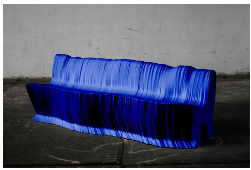
Cutting Edge by Martijn Righters.

Having first discovered his flair for experimental product design at the Royal Academy of Art in the Netherlands, later honing it the Royal College of Art in the UK, Dutch designer Martijn Rigters is currently based between London and Vienna. The designer's sofa range, Cutting Edge, is the result of his experimentation with hot-wire cutting. Sparked from the idea of movement as a liquid form, a large-scale cutting machine was built to capture the movements of the maker and directly translate them into a permanent shape. Elsewhere, The Colour of Hair (a collaboration with his fellow RCA alumnus Fabio Hendry) carbonises the keratin in human hair into hardened aluminium to create etching-like surface prints.