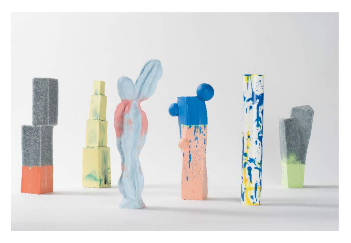
Oedipus by Boris de Beijer.

Following its debut in 2017, Dutch Stuff returns to London Design Fair at the Old Truman Brewery in East London this September. Whereas last year's show was all about making a statement – exhibiting the work of more than 60 Dutch collectives, studios and independent designers – this year's offering is a more refined affair. By scaling the exhibitors back, the designs will be afforded space to breathe, and visitors will have more opportunity to explore the individual designers, products and ideas that are driving contemporary Dutch design thinking forward.