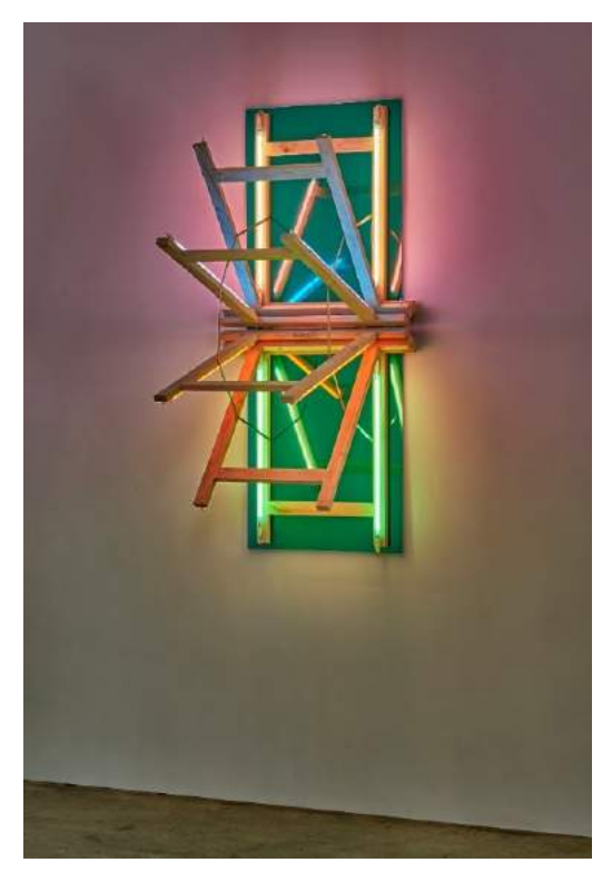
Trestle Dazzle Wall by Rem Atelier.