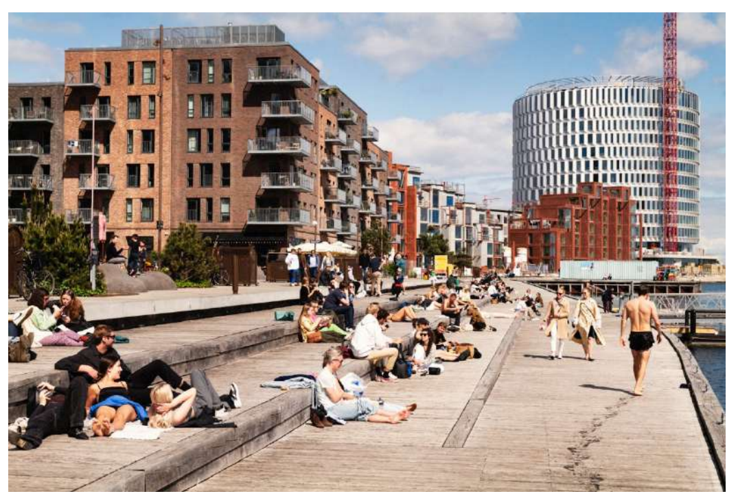
Copenhagen

Now in its 15th year, Monocle's annual quality of life survey honours the world's 25 most forward-thinking, safe, easy, sustainable, and inspiring cities in which to live. Published in the magazine's current (July) issue, the shortlist names Copenhagen the world's best city 2022, closely followed by Zürich, Lisbon, Helsinki and Stockholm.