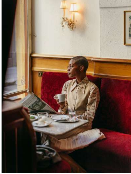
Vienna waterfront, left and cafe, right.