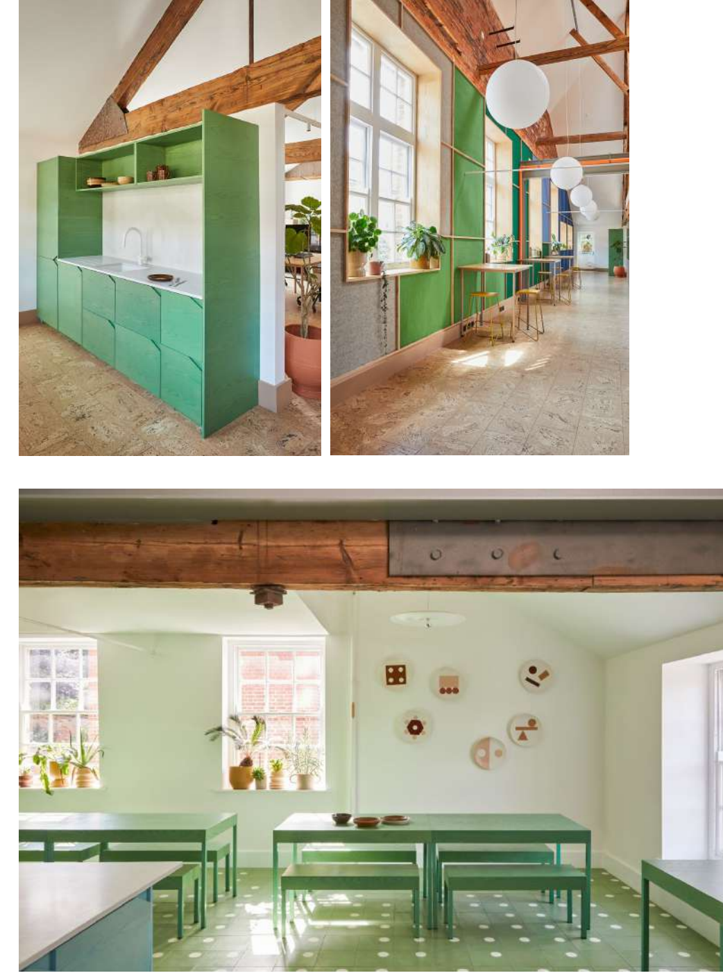
Traditional Mallorcan tile maker Huguet supplied the bespoke green floor tiles for the Omlet canteen.