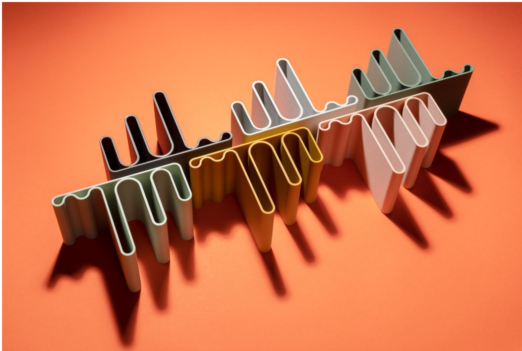
Bene's bFRIENDS collection by Pearson Lloyd explores new materials and new forms made possible by 3D printers Batch.Works.