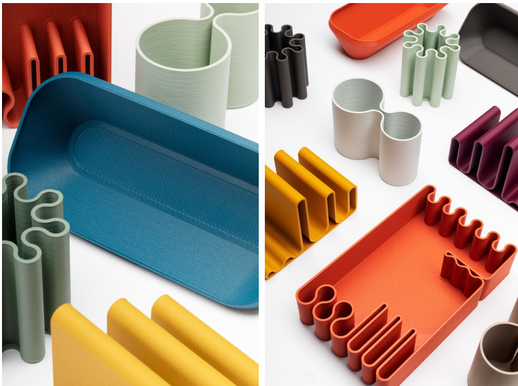
bFRIENDS’ circular production model offers hope for the future of sustainable design and manufacturing.

Bringing together Bene’s resources as an international leader in workplace innovation, Pearson Lloyd’s design vision and user experience expertise, Batch.Works’ forward-thinking circular production model and material understanding, bFRIENDS elegantly demonstrates the viability – indeed, the necessity – of circular-design models as a response to climate emergency.