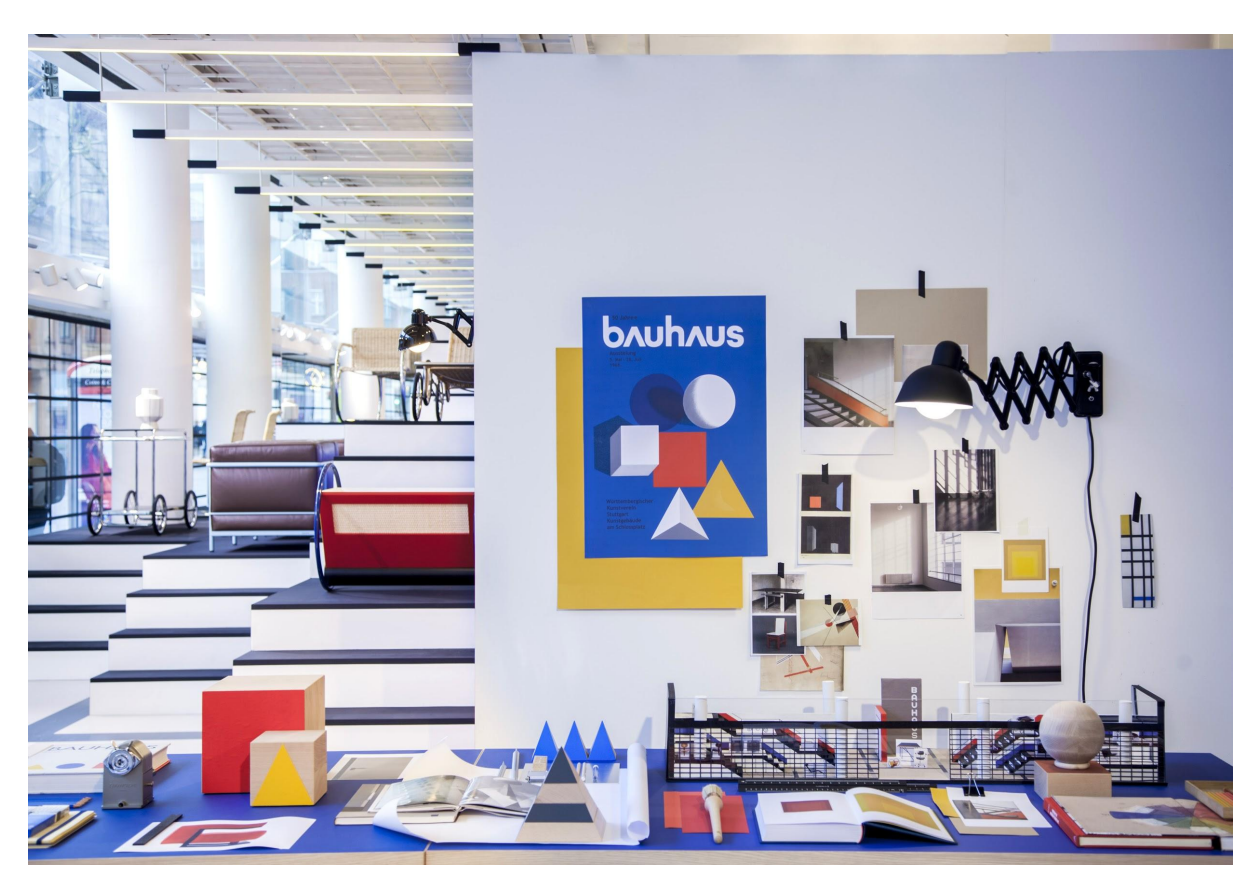
The Conran Shop celebrates the centenary of the Bauhaus