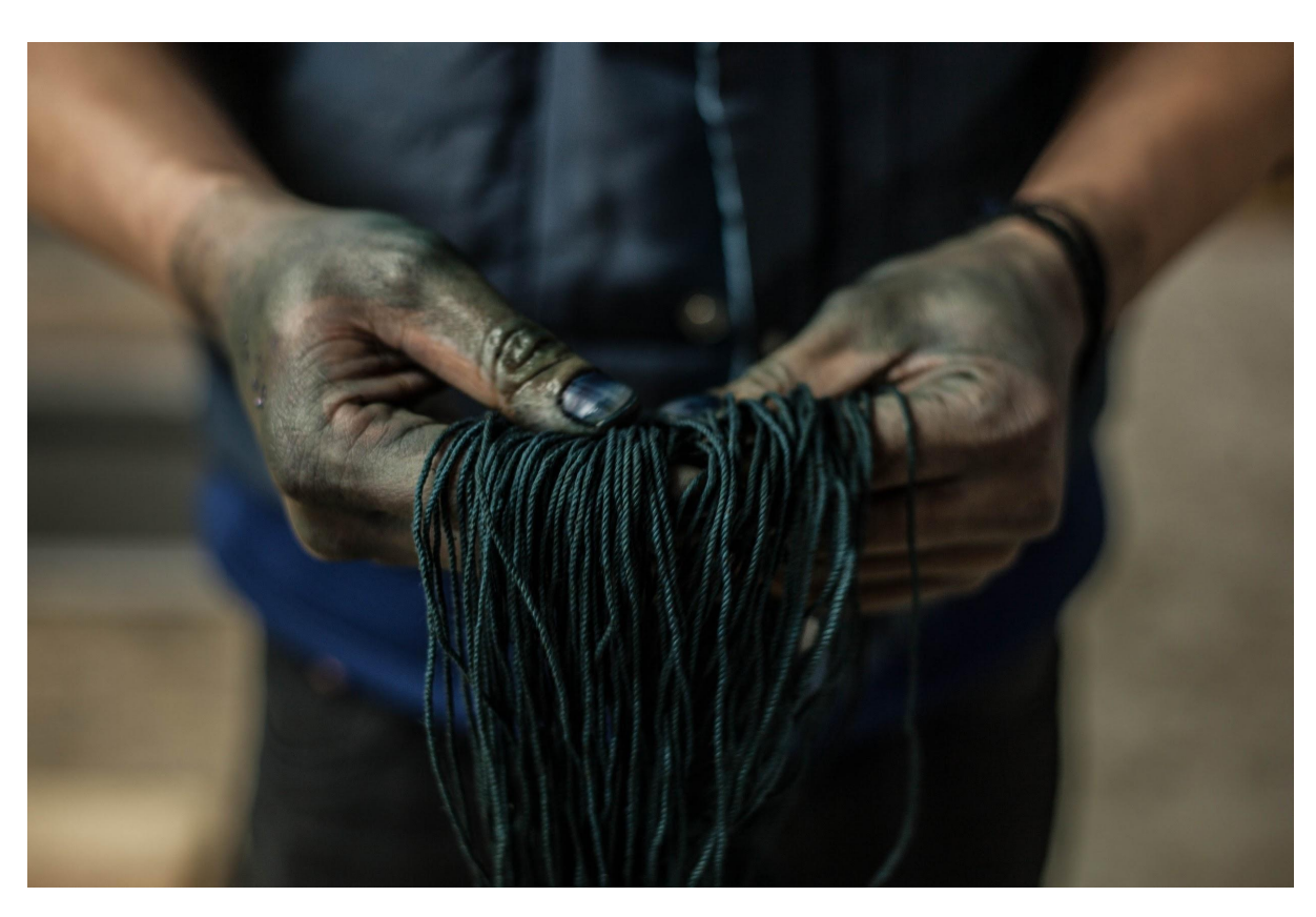
Japanese artisan/farmer collective BUAISOU

Mount Street will become its own mini design trail with flagship fashion boutiques, including Christian Louboutin, Bremont , Roksanda , Erdem and MATCHESFASHION . COM , set to host bespoke Craft Week exhibitions, demonstrations, talks and more.