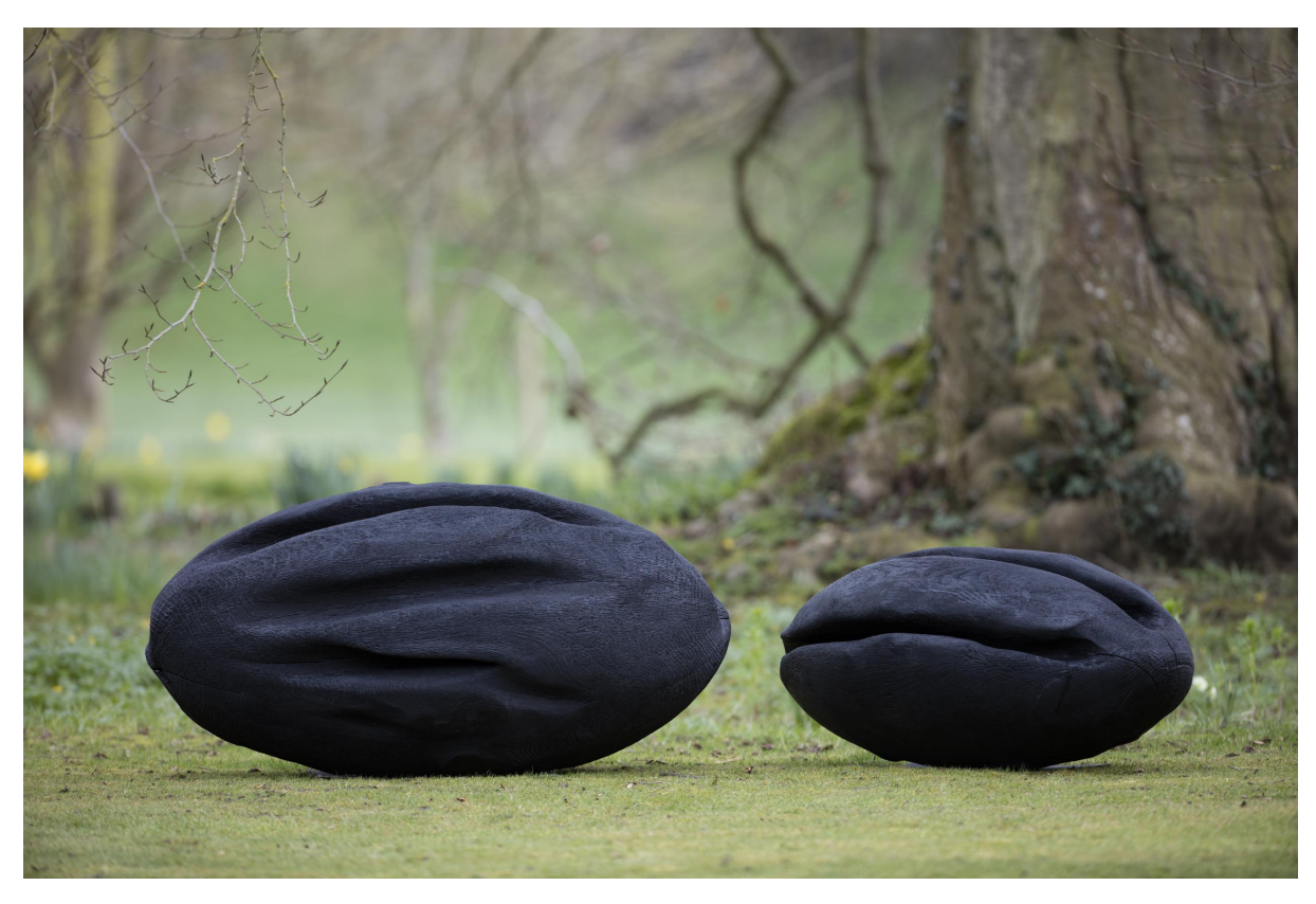
Charred Pod I & II by Alison Crowther, part of Scorched

To help visitors find their way around the festival and plan their own journey of discovery, the London Craft Week programme is divided across the five areas of London (Central, North, South, East and West), each one a distinct and navigable destination with dozens of events on offer.