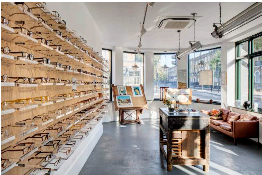
Cubitts King's Cross workshop.

Like its other shops, Cubitts' King's Cross outlet will offer its range of handmade frames and sunglasses available to buy, as well as the brand's celebrated bespoke service, which enables people to have a design specialist custom-make perfect-fitting spectacles to suit their individual style, or to recreate existing frames. In addition, the basement workshop will be the home of the Cubitts Academy , where Cubitts staff will be trained in all aspects of optical dispensing and other essential skills in the spectacle maker's craft.