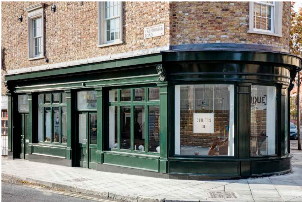
Cubitts King's Cross workshop.

Cubitts don't just take naming inspiration from their environments; they draw design inspiration too (for example, the custom-made rivets that hold the frames together are based upon the design features of Lewis Cubitts' original Granary Building). The décor of the new shop is no exception, taking cues from the history of the area to create a uniquely enticing interior and celebrating the railway heritage of King's Cross by painting the building exterior in Flying Scotsman green.