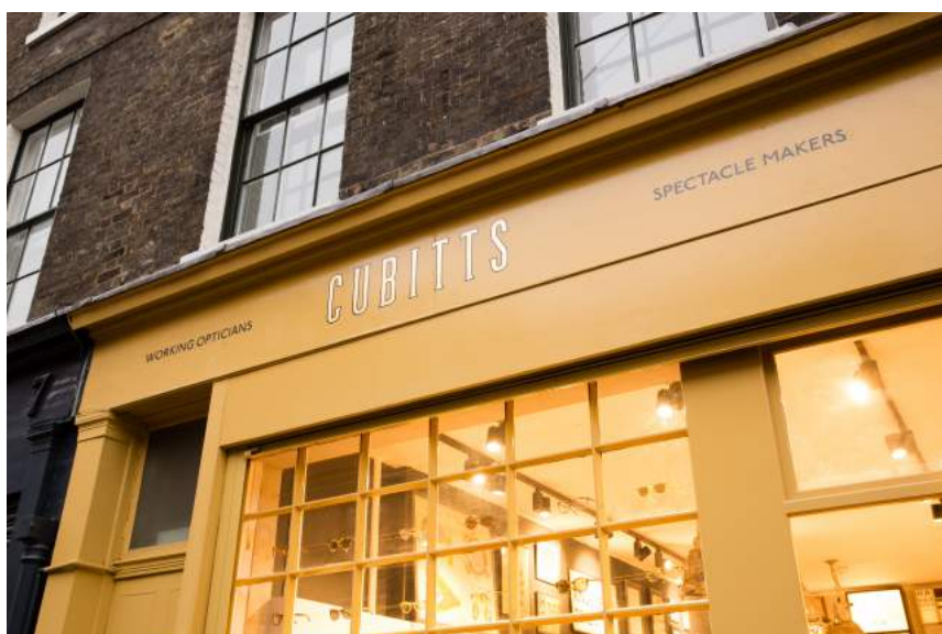
Cubitts Borough workshop