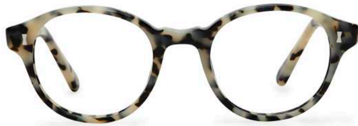
Barbon spectacles by Cubitts

Like its other shops, Cubitts' King's Cross outlet will offer its range of handmade frames and sunglasses available to buy, as well as the brand's celebrated bespoke service, which enables people to have a design specialist custom-make perfect-fitting spectacles to suit their individual style, or to recreate existing frames. In addition, the basement workshop will be the home of the Cubitts Academy , where Cubitts staff will be trained in all aspects of optical dispensing and other essential skills in the spectacle maker's craft.